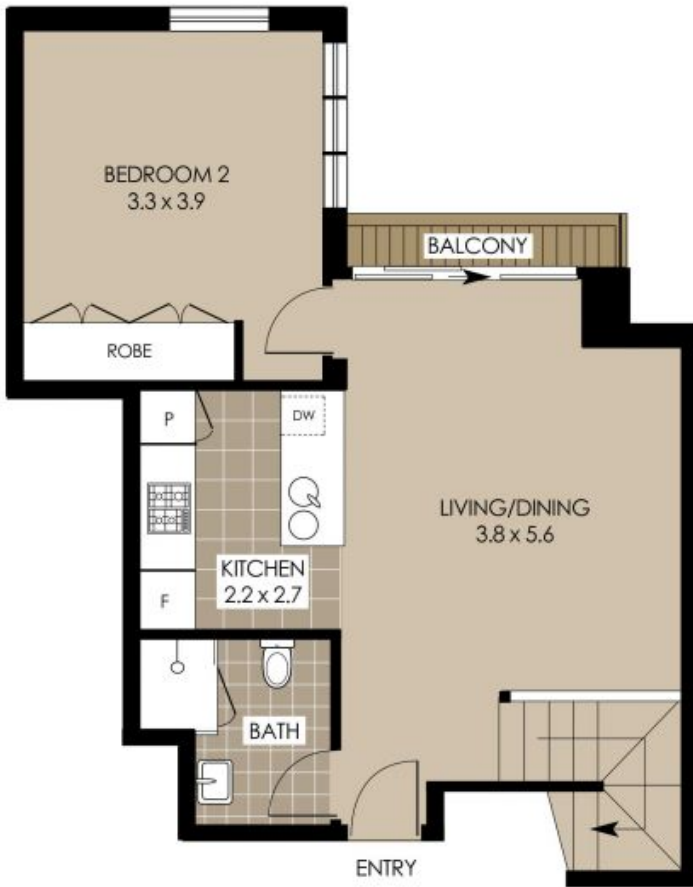
LEVEL 8 FLOOR PLAN