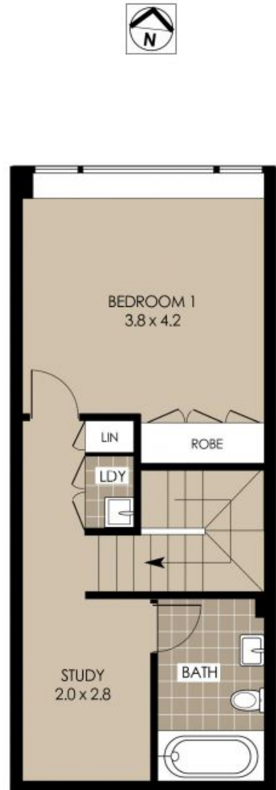
LEVEL 9 FLOOR PLAN