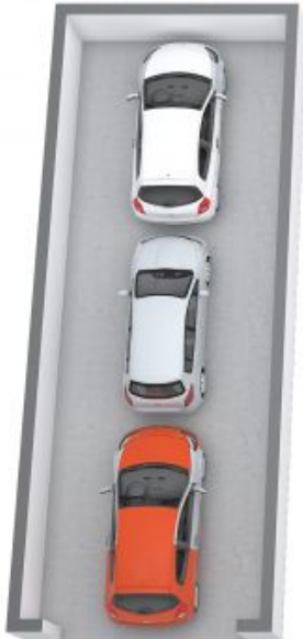
Not In Position