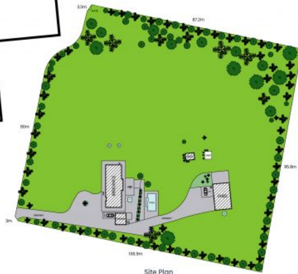
Site Plan Land Size: 9900sqm

Internal Area: 148 sqm External Area: 176 sqm Sheds Area: 106 sqm Garage Area: 25 sqm Total Area: 455 sqm