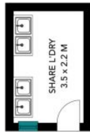
(NOT IN POSITION)