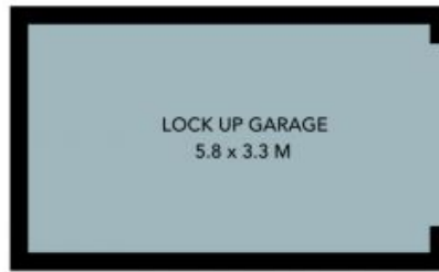
(NOT IN POSITION)