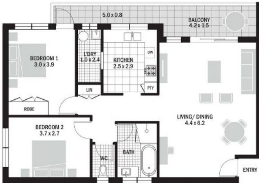
Apartment Floor Plan