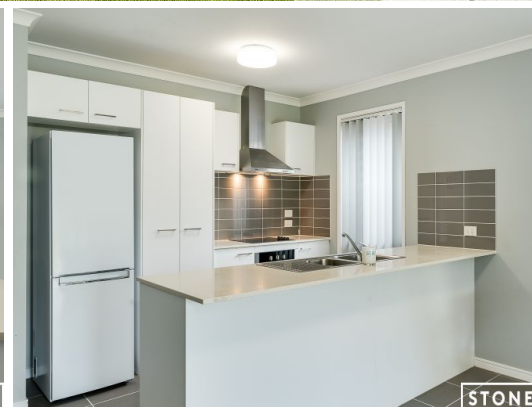
6 Pintail Circuit Deebing Heights, QLD