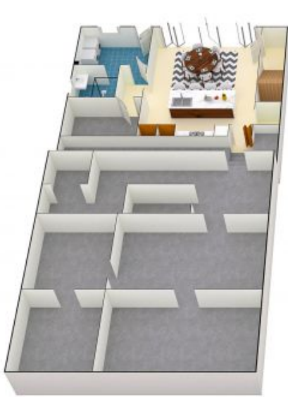
Lower Ground Level