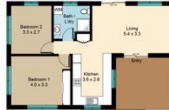
Granny Flat (Not Shown In Actual Location / Orientation)