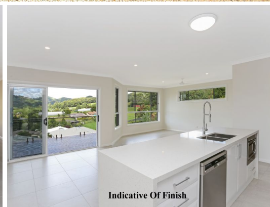
Indicative Of Finish