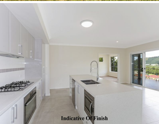
Indicative Of Finish