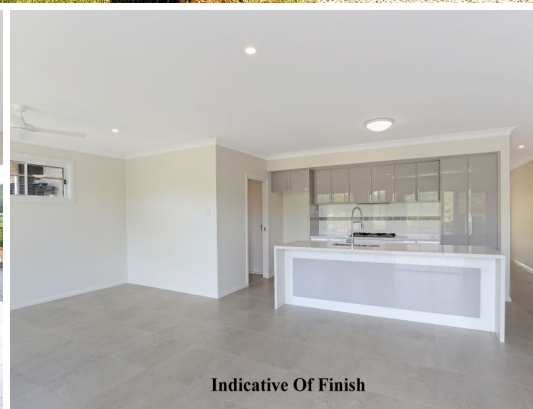
Indicative Of Finish