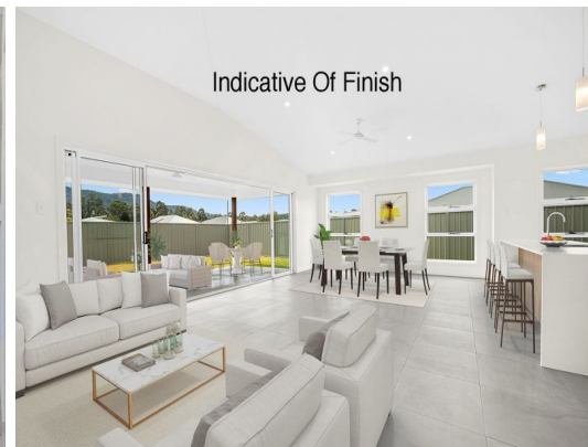
Indicative Of Finish