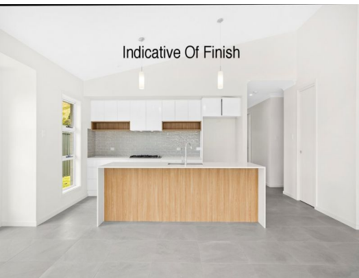
Indicative Of Finish