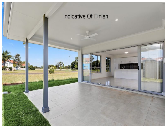
Indicative Of Finish