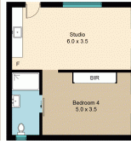
(Not Shown In Actual Location / Orientation)