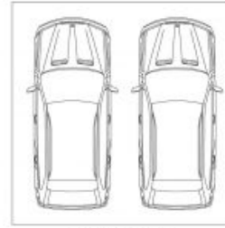
DOUBLE PARKING 28m 2 (NOT ACTUAL LOCATION)