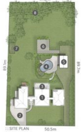
:: SITE PLAN 50.5m