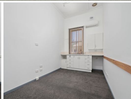
60 Carrington Street West Wallsend, NSW