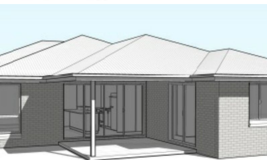
CTIVE VIEW: REAR