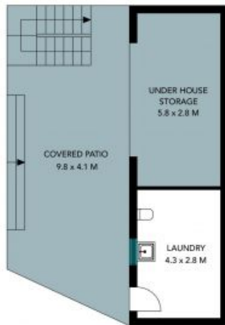
Lower Ground Level