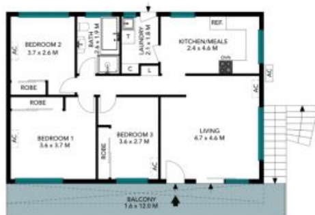
Upper Ground Floor