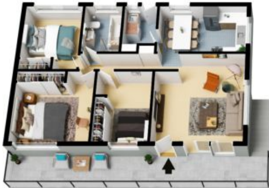
Upper Ground Floor