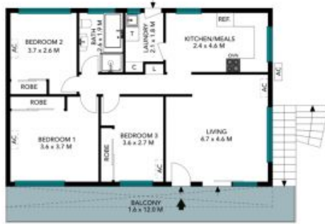
Upper Ground Floor