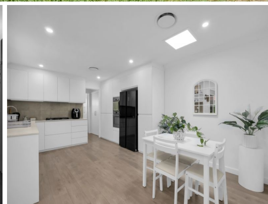
21 Kenny Close St Helens Park, NSW 4 [bed icon] 2 [bath icon]