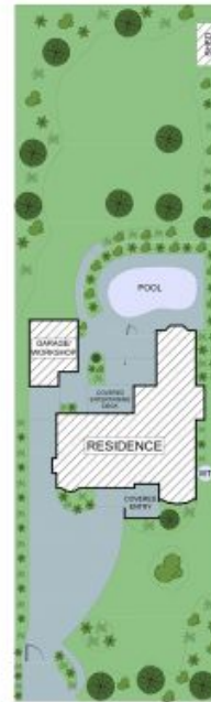
SITEPLAN (NOT TO SCALE)

The site plan and floor plan are not to scale; measurements are indicative and in metres. Bushes and trees are placed for illustration purposes. Plans should not be relied on. Interested parties should make and rely on their own enquiries. All other information provided has been collected from reliable sources but cannot be guaranteed for accuracy.