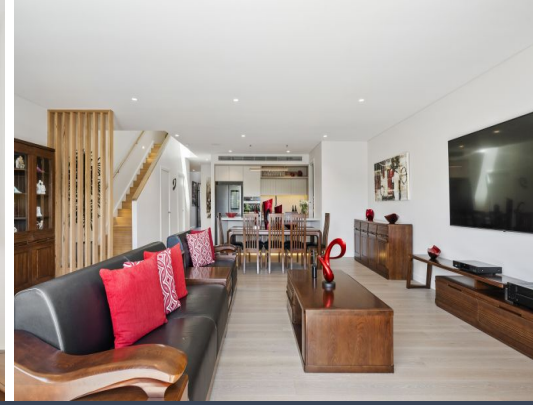
28 Strangers Creek Place Bella Vista, NSW 4 [bed icon] 3 [bath icon] 2 [car icon]