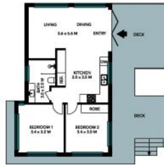
NOT IN POSITION