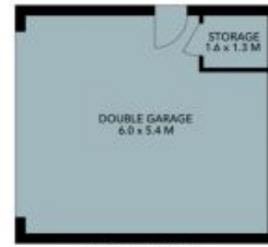
(NOT IN POSITION)

Internal Living: 128 sqm External Living: 60 sqm Total Living Area: 188 sqm