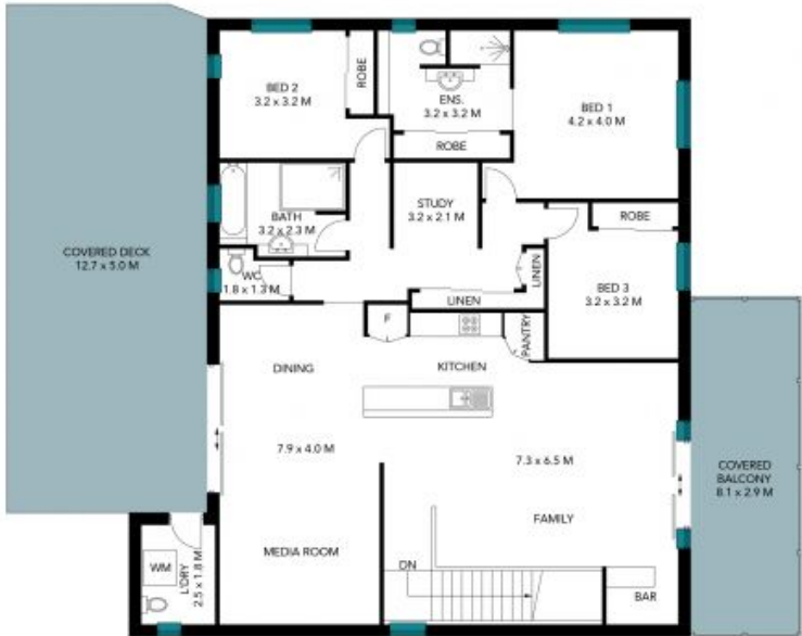
Upper Level Floor