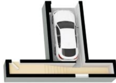
Lower Ground Level