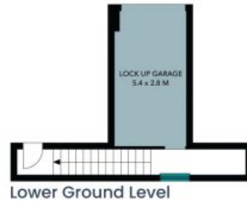
Lower Ground Level