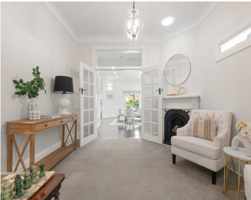
12 Alexander Parade Roseville, NSW