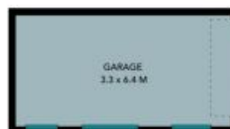
(NOT IN POSITION) Lower Ground Floor