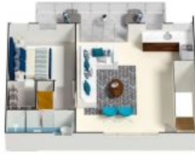
Additional Residence Upper Level