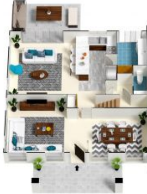
Main Residence Lower Level