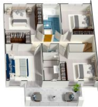
Main Residence Upper Level