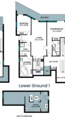
Lower Ground 1