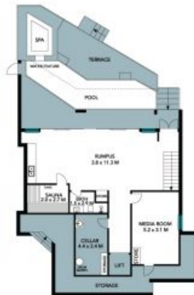
Lower Ground 2