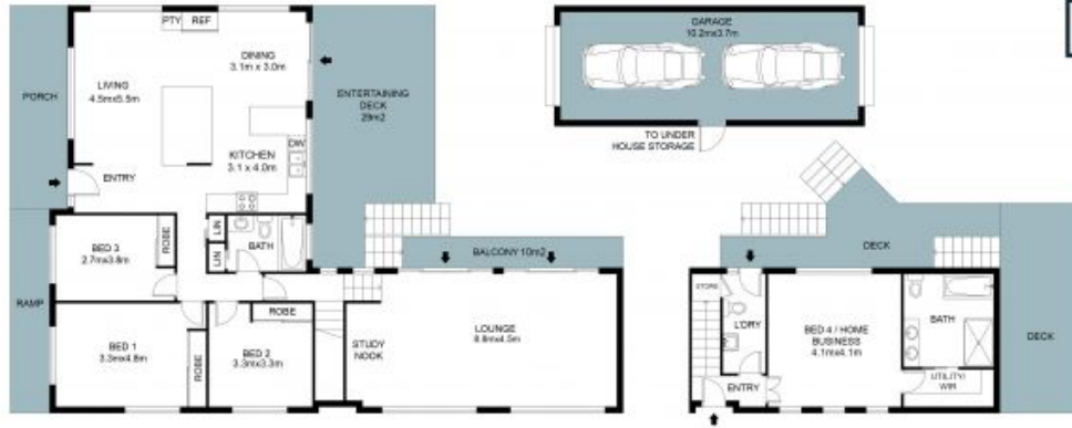
Ground / Upper Floor