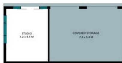
ACCESS TO UNDER HOUSE