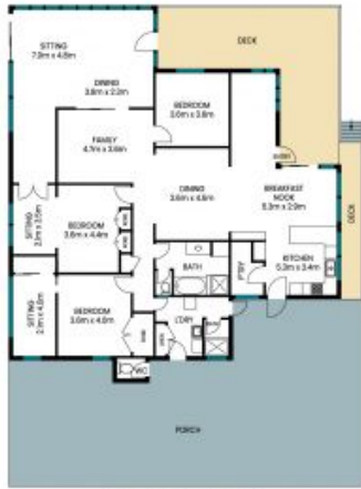
Country Farm House