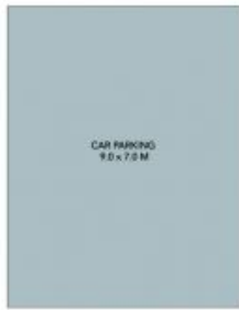
(NOT IN POSITION)