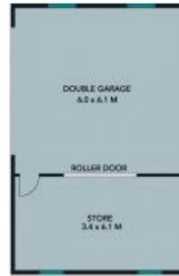
(NOT IN POSITION)