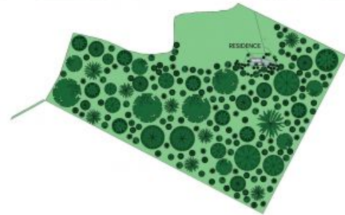
Internal Area: 210sqm External Area: 182,640sqm Land Area: 182,854sqm