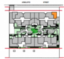
KEY PLAN SCALE: 1:2000