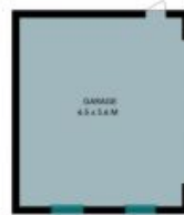
NOT IN POSITION