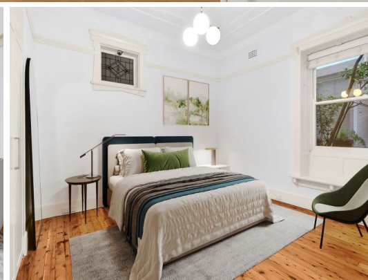
2/6 Holbrook Avenue Kirribilli, NSW 3 1