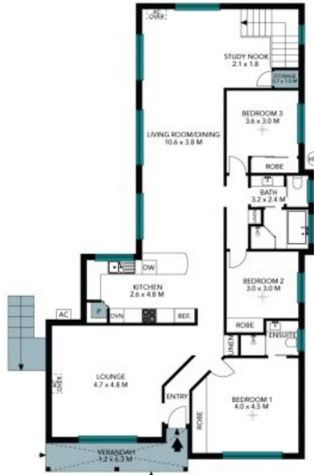
Upper Ground Floor