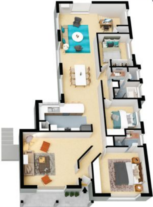
Upper Ground Floor