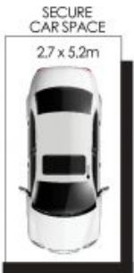
Basement Level B2

The site plan and floor plan are not to scale, measurements are indicative and in metres. Bushes and trees are placed for illustration purposes. Plans should not be relied on. Interested parties should make and rely on their own enquiries. All other information provided has been collected from reliable sources but cannot be guaranteed for accuracy.