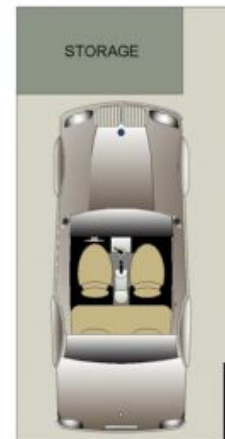
SECURE UNDERCOVER CARSPACE