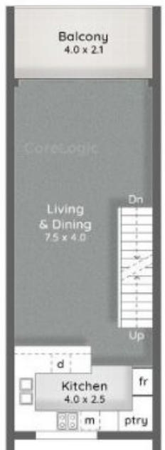
FLOOR PLAN First Floor 2.6m Ceiling