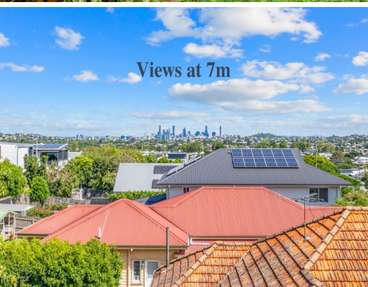
Views at 7m