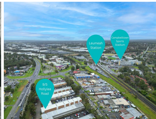
9/5 Hollylea Road Leumeah, NSW