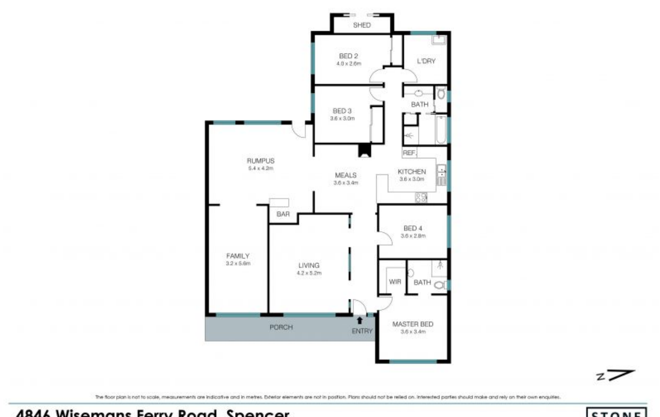
4846 Wisemans Ferry Road, Spencer