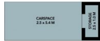
(NOT IN POSITION)