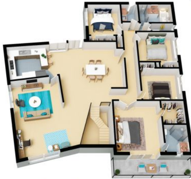
Upper Ground Floor

Internal Living: 216 sqm External Living: 10 sqm Total Living Area: 226 sqm