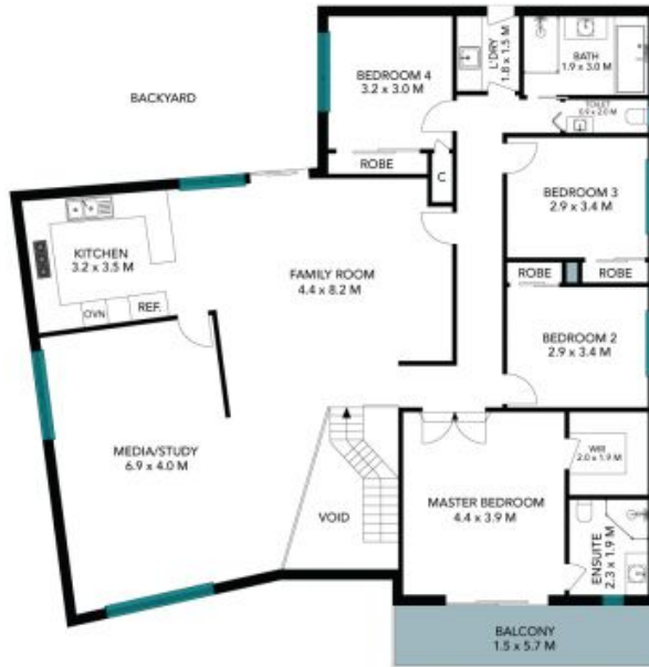
Upper Ground Floor