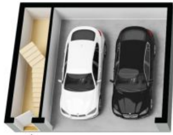
Under Ground Floor