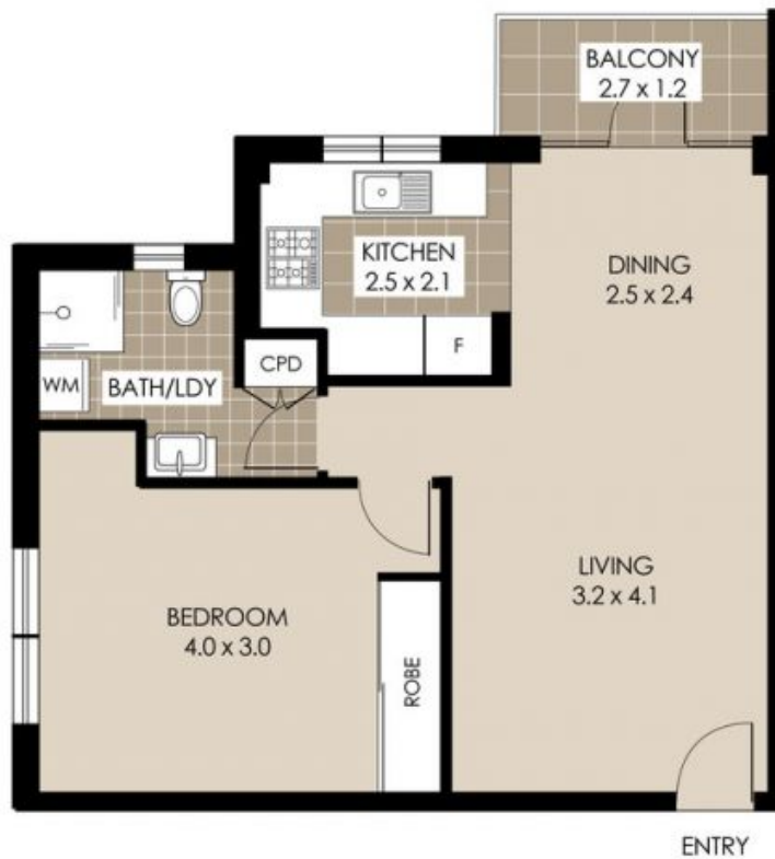
APARTMENT FLOOR PLAN