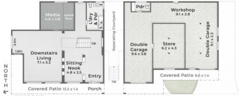
:: GROUND FLOOR 2.5m - 2.8m Ceiling