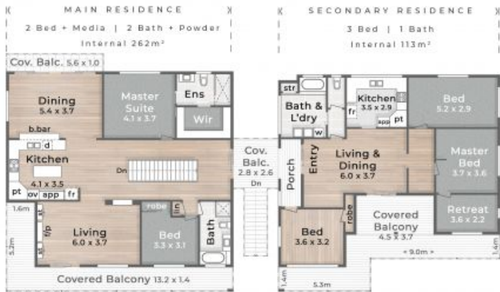
:: FIRST FLOOR 2.6m - 2.7m Ceiling