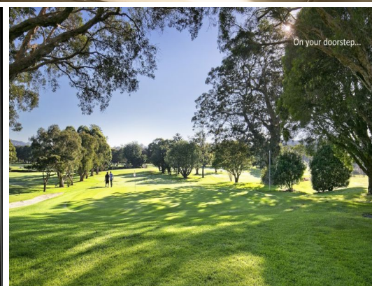
On your doorstep...