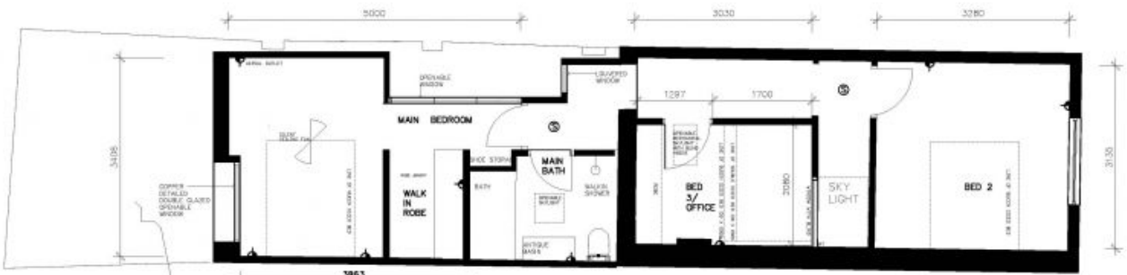
2.0 1ST FLOOR